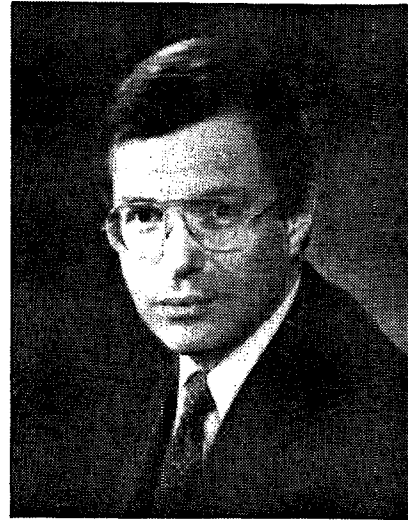
Dick Zimmer For Congress "Fiscally, Extremely Conservative"